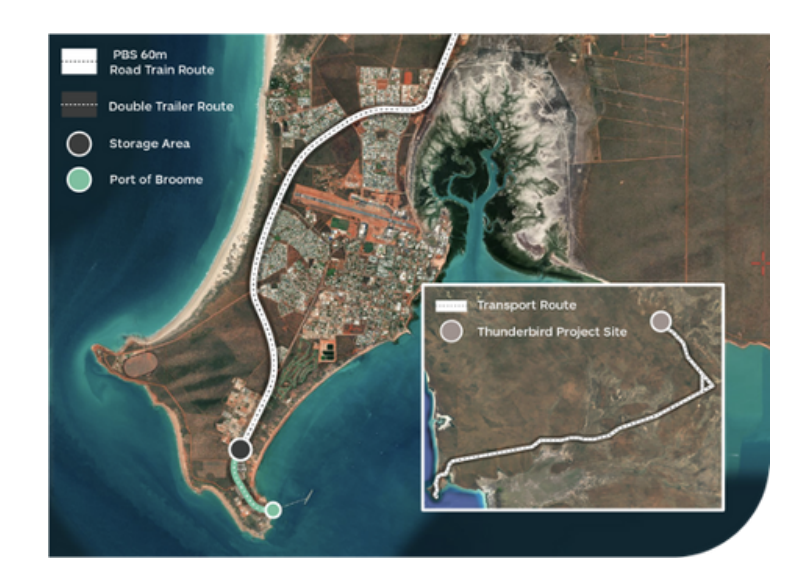
Map showing proposed transport route from Thunderbird to Broome along the heavy haulage route.

Access to the areas inside the Port boundary is the responsibility of the Kimberley Port Authority, however it is not anticipated that access to Entrance Point or the boat ramps will be affected during shiploading, much like when a live export boat is being loaded with cattle currently.